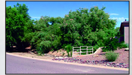
Overgrown vegetation can threaten structures.