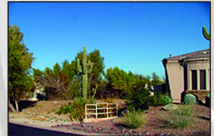
Survivable space minimizes risk to the property and community.